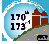
Baseline to Walker Project