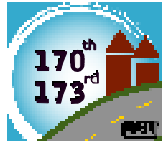
Baseline to Walker Project